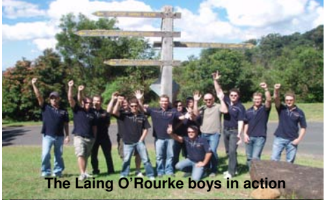
The Laing O'Rourke boys in action

options to suit any budget. The conference rooms are also perfect for meeting our needs. We do not need nor do we want the typical 'sterile' option which is the norm for nearly all conference facilities, so being able to run workshops in the Old Barn, the Pottery Shed or Library reinforces the innovative approach we are teaching in the programs. It's amazing how an open fire can be a source of great reflection and relaxation especially when it forms part of your training room. Best of all is the relaxed, flexible and resourceful staff. No problem, no matter how weird or wonderful it is, is ever too hard for the Binna Burra crew to solve. Sure you may need to be a bit flexible on your end but isn't that just life? It's certainly what our leadership teachings is all about. Binna Burra - it's got it all and more!"