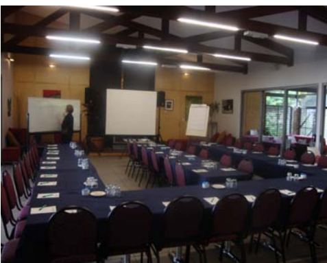
The Teahouse ready for a conference